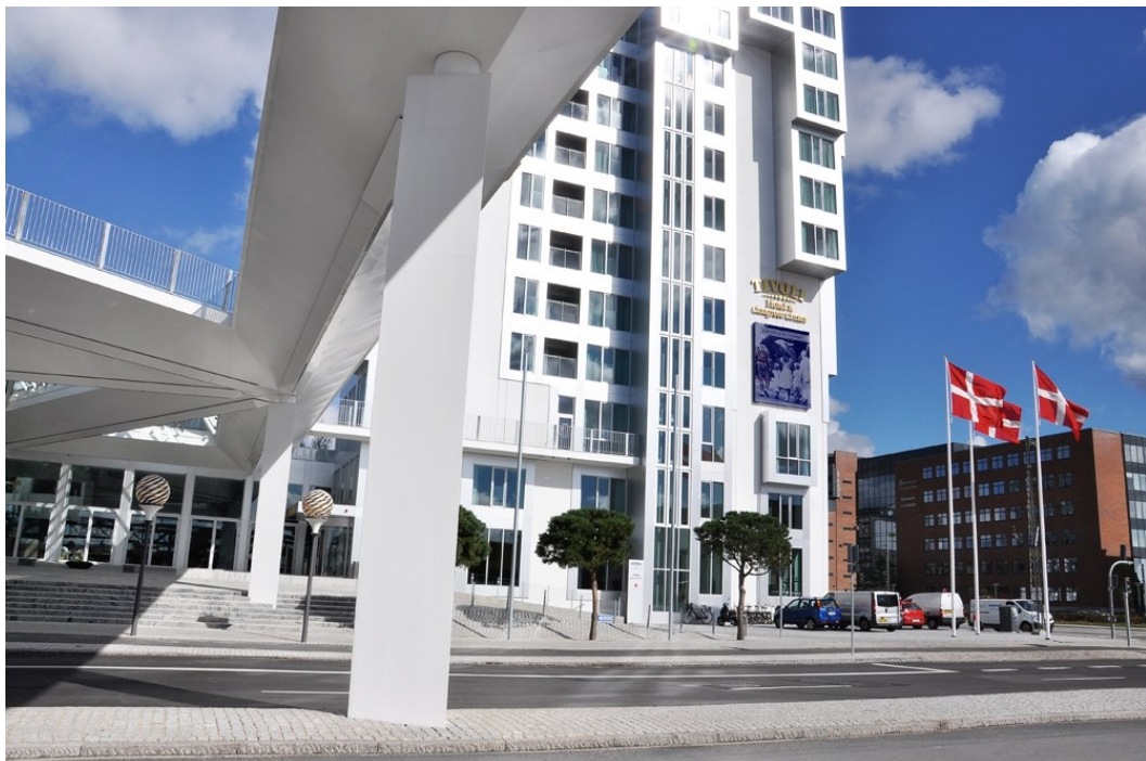
Tivoli Congress Center

Please note stand no 1 & 2 is only for Platinum Partnership.